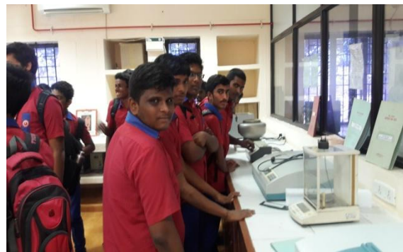
School Students visited our College