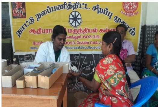
NSS Medical Camp