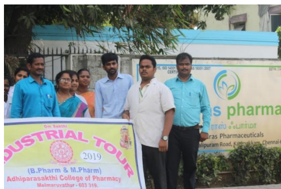
Industrial visit of our Students