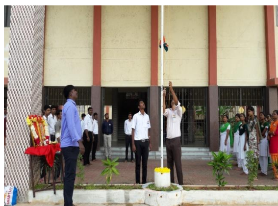
Flag hoisting by NSS Officer on Republic day