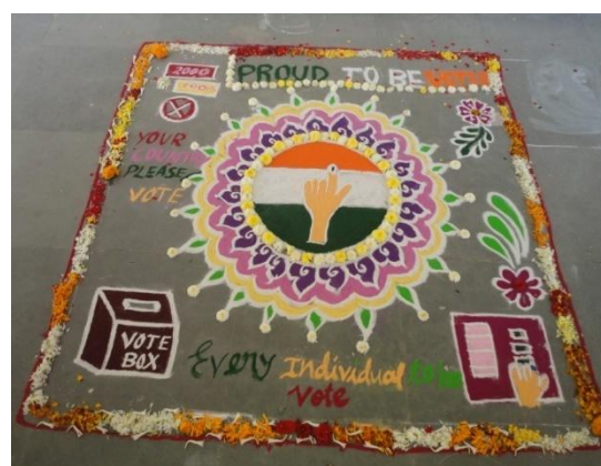
National Voters Day Rangoli Competition