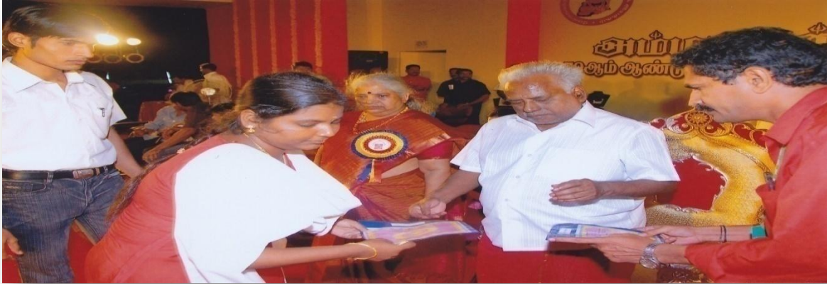
Our Founder President distributing prize to the topper in the College