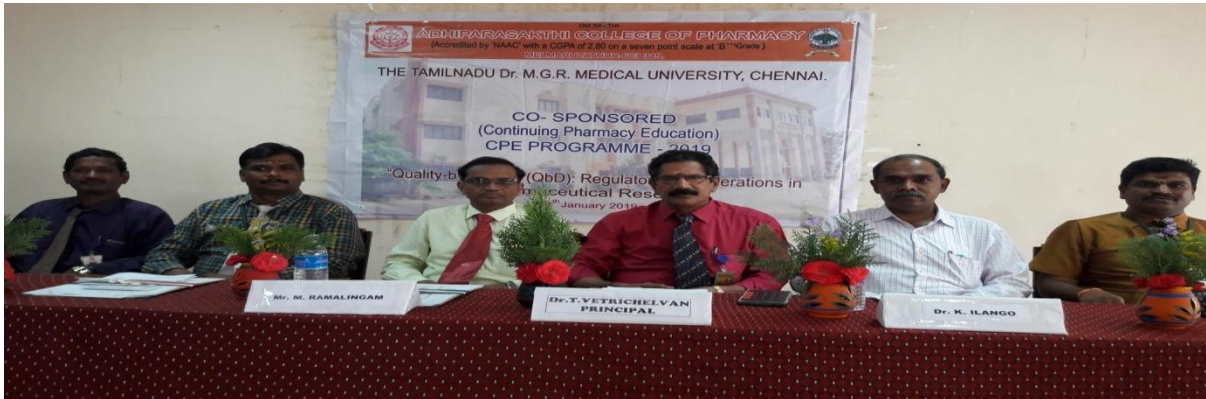
CPE Programme Inaguration